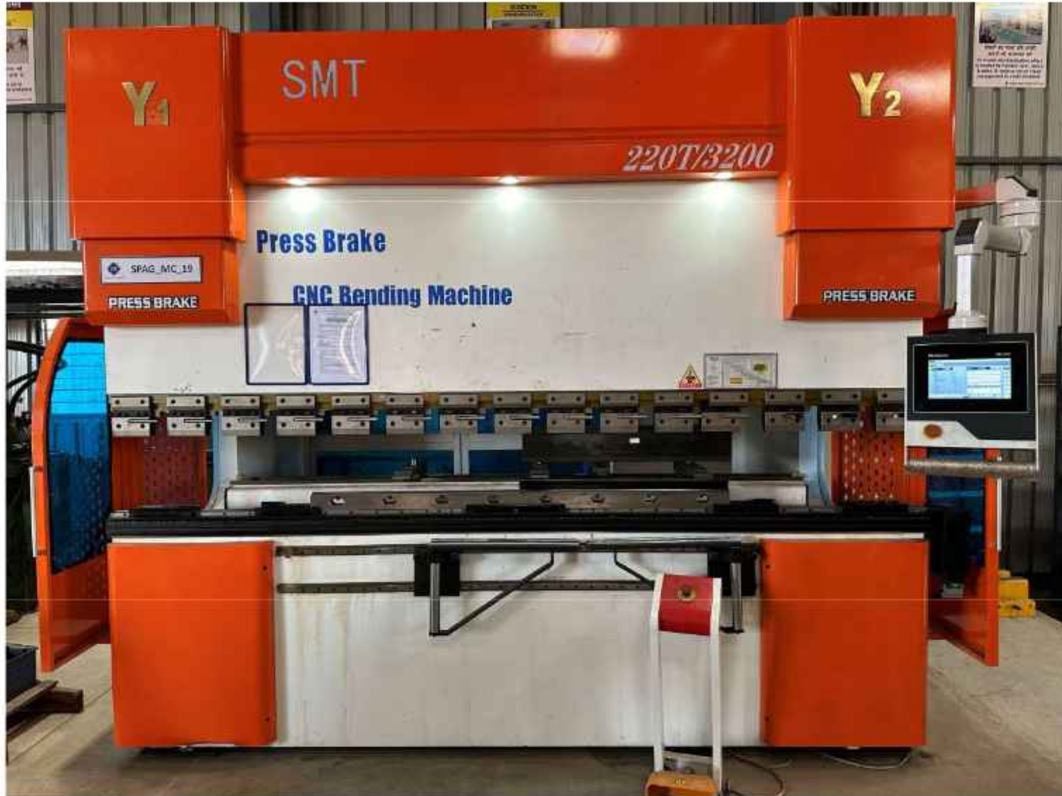
CNC HYDRAULIC PRESS BRAKE 220 TON X 3200MM, 5 AXIS