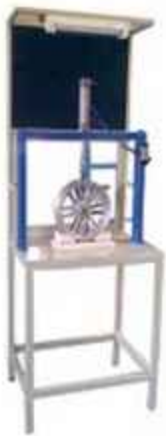
VALVE PRESS MACHINE