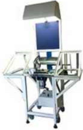
OIL PUMP TESTING MACHINE