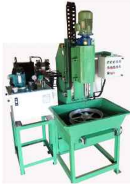
ATUO DRILLING SPM