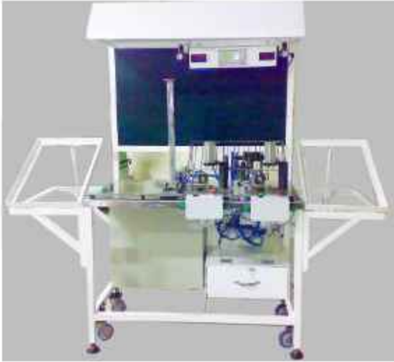
ASSY. WORK STN. WITH SEMI AUTOMATION