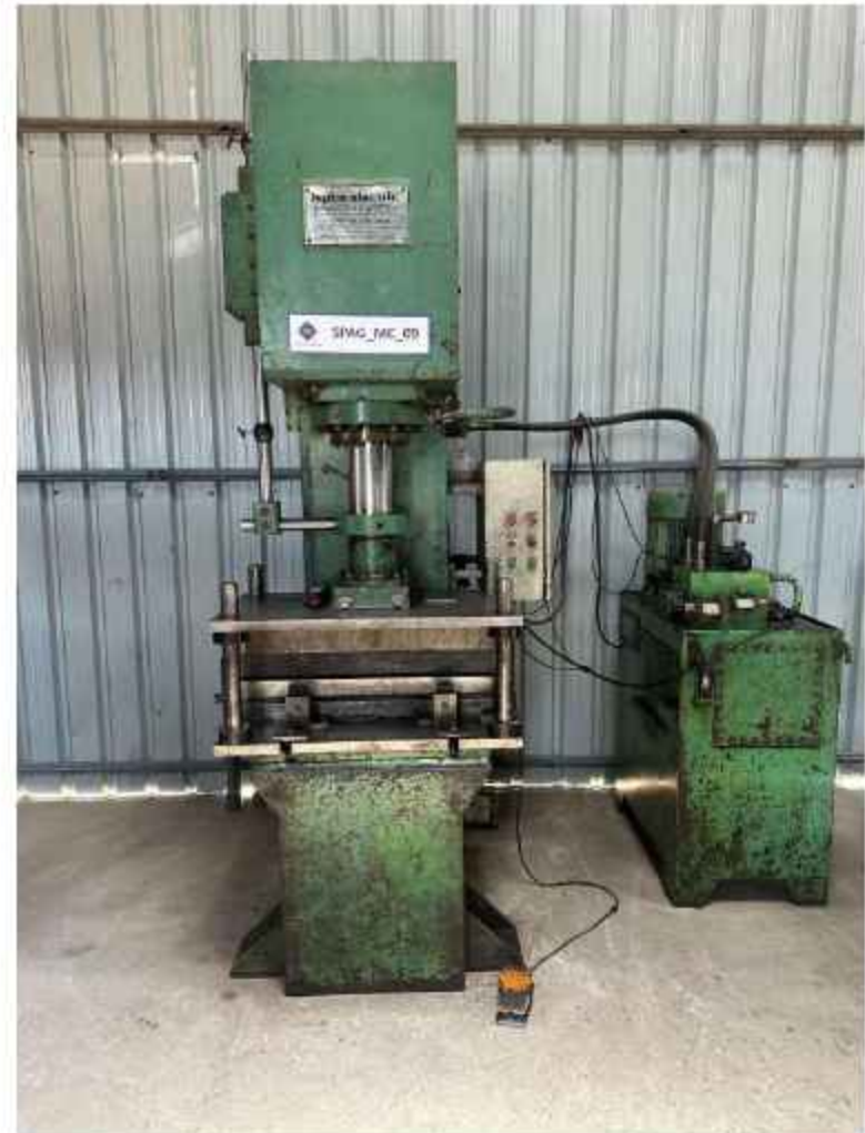
HY. PRESS MACHINE