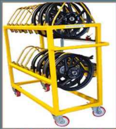
ALLOY WHEEL TROLLEY