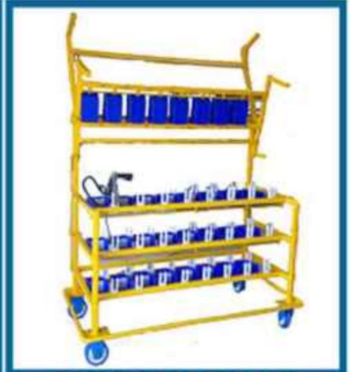
FOLDING TYPE TROLLEY