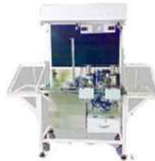
WORKSTATION FOR OIL PUMP TESTING