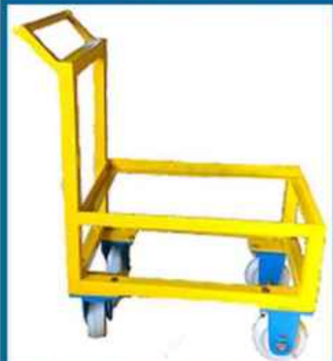
PLASTIC BINS HANDLING TROLLEY