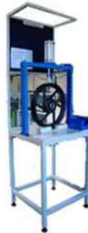
VALVE PRESS MACHINE FOR CAST ALLOY WHEEL