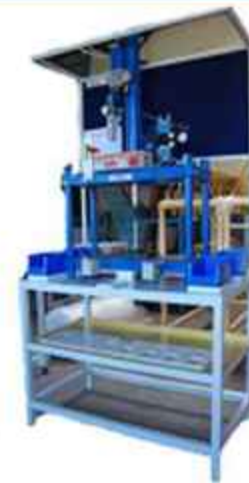
WHEEL BEARING PRESS MACHINE - 2 T