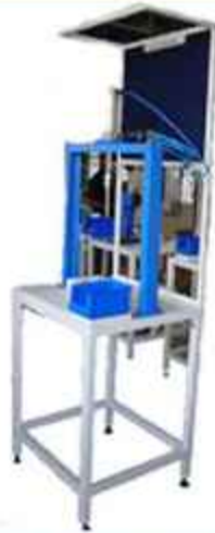
TUBELESS TYRE VALVE PRESS WORKSTATION