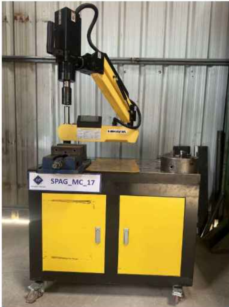
TAPPING M/C WITH WITH MOVING ARM