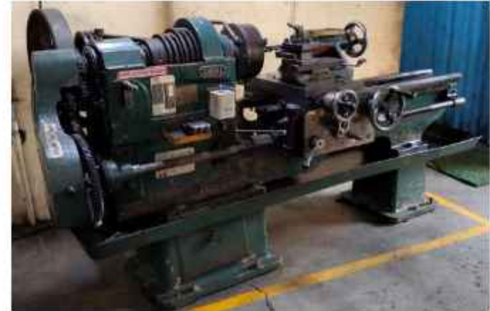
CONVENTIONAL LATHE MACHINE