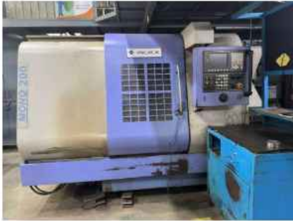
CNC TURNING MACHINE