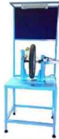
WHEEL RUN OUT CHECKING WORKSTATION