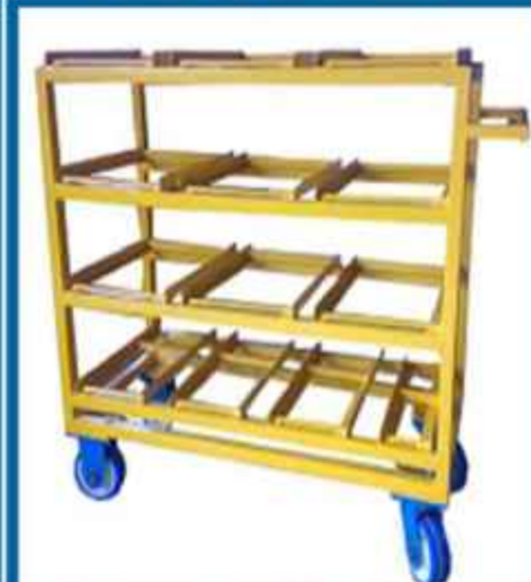
TROLLEY FOR PLASTIC WHEELS